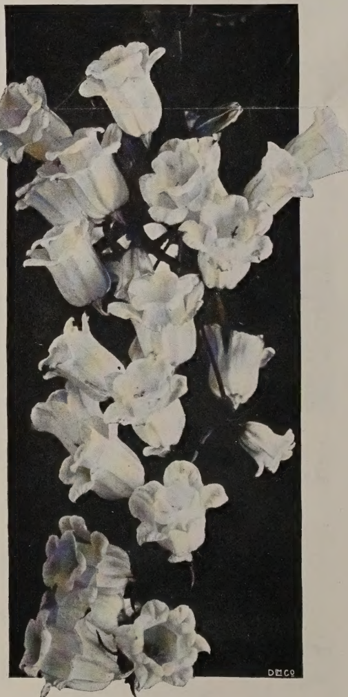
Old Fashioned Canterbury Bells